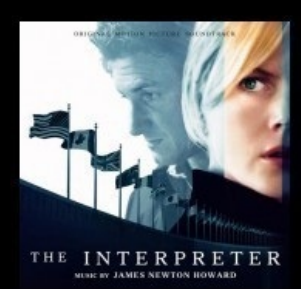
What my mom thinks I do.